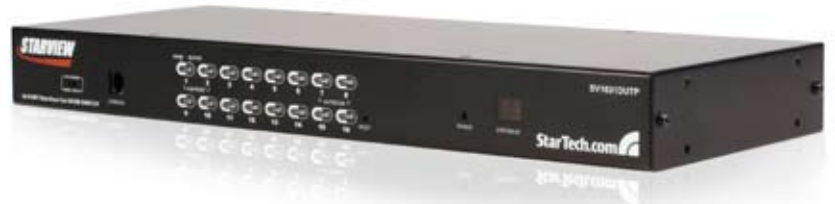
16 Port: SV1631DUTP