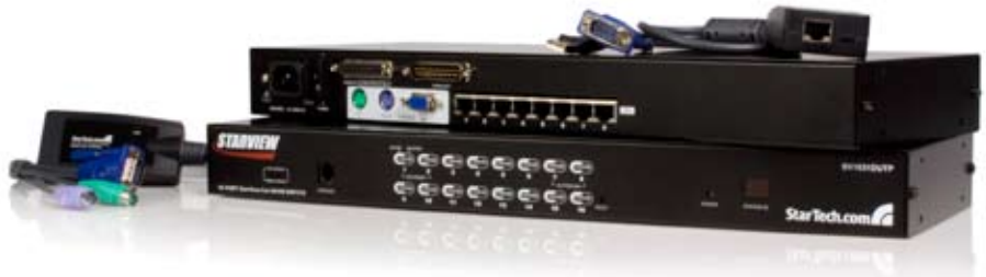
8 Port: SV831DUTP 16 Port: SV1631DUTP

The convenient pushbutton and hot-key commands allow for quick, reliable switching between your systems. Manual and Auto scan modes are supported. Our slim design needs only 1U in your cabinet and uses rear cable connections for maximum space efficiency. Available in 8 and 16 port models, they can be cascaded to support up to 512 computers providing additional flexibility as your organization grows.