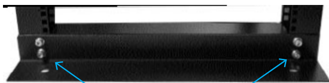
Hex Socket Screws

2. Attach the floor mounting brackets (the L-shaped brackets) to the bottom of the frames. Using the included hex key, install the hex socket screws. Install 4 screws per bracket.