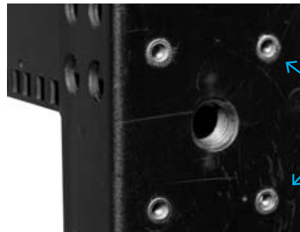
Optional Caster mounting point, on bottom of rack frame

1. Make sure that the front and rear frames are right side up. The bottom of the frame has holes for the floor mounting brackets and casters. Make sure that the pictured end is at the bottom.