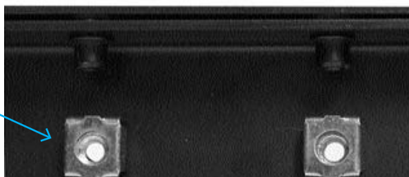
Pre-installed cage nuts

NOTE: When installing the arms, it might be easiest to start with the top arms for stability reasons.