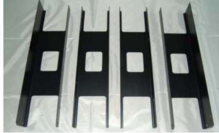
4 x Top/Bottom Rails