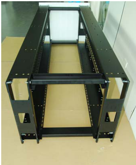
Bottom of Rack