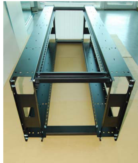
Top of Rack