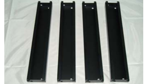
4 x Join Brackets