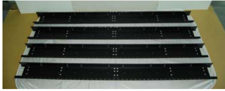
4 x Vertical Rails