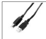
USB2HAB15 15 ft High Speed Certified USB 2.0 Cable