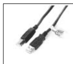
USB2HAB6 6 ft High Speed Certified USB 2.0 Cable

Contact your local StarTech.com dealer or visit www.startech.com for cables or other accessories that will help you get the best performance out of your new product.