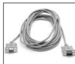
MXT100_25 25 ft. 9-pin Straight Through Cable (male to female)