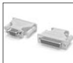
AT925FF Adapter DB9F to DB25F