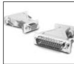
AT925FM Adapter DB9F to DB25M