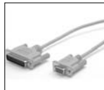
MC3MF 3 ft. AT Modem Cable DB9F-DB25M

Contact your local StarTech.com dealer or visit www.startech.com for cables or other accessories that will help you get the best performance out of your new product.