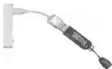
Sample connection to a USB device using the provided adapter